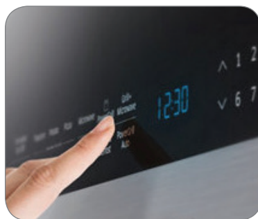
Precise Glass-Touch Controls

Fingerprint Resistant Black Stainless Steel