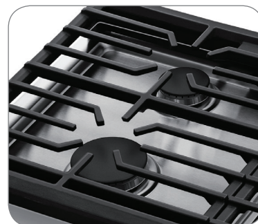
Continuous Cast Iron Grates