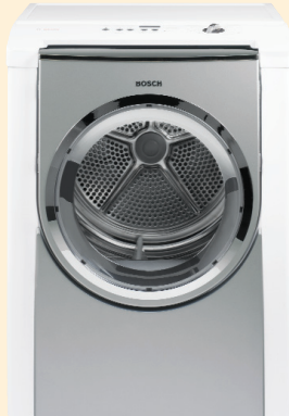
WTMC8330US/CN (Electric) WTMC8530UC (Gas)